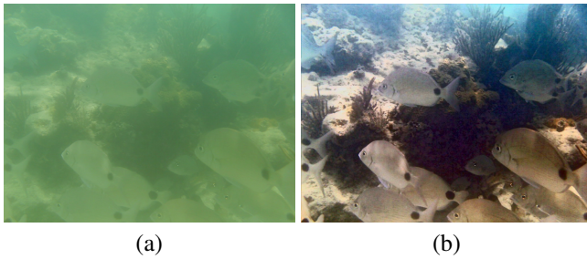
Fig. 2. (a) the observed image. (b) the enhanced image by proposed approach.

takes about 5 seconds to process one color image with size of 950 \times 720 . More experimental results can be found on our website: http://smartdsp.xmu.edu.cn/underwater.html .