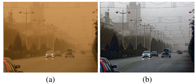
Fig. 4. (a) the observed sandstorm image. (b) the enhanced image by proposed approach.